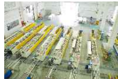
● Production Site