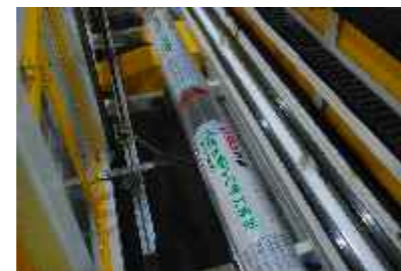
● Film Clamping Structure