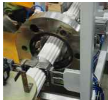
● Bundling Structure