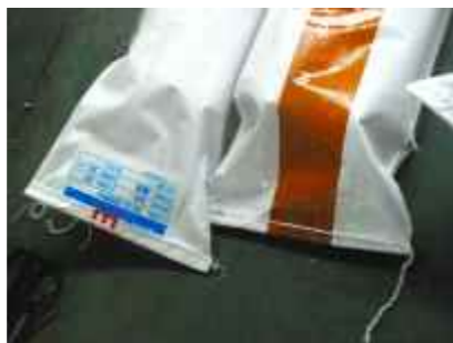
● Packaging Bag