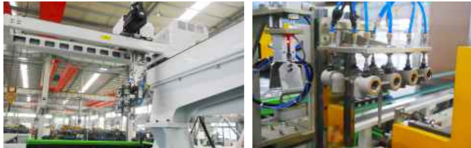
▼ Plastic Pipe Fitting Metal Inserts, centralized Gate Cutting, centralized Packaging Production Line

According to different molding product structure, we provide to customers with different solutions, including manipulator for injection mold inserts, centralized spur cutting, online assembling, mixed conveying, online inspection, sorting packing, etc.