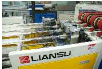
● Cutting Structure