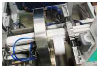
● Bundling Structure