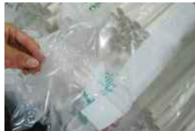
● Sealing Effect