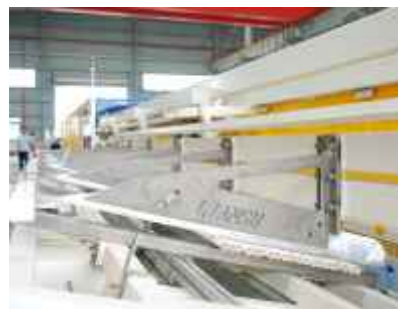
● Stocking Device