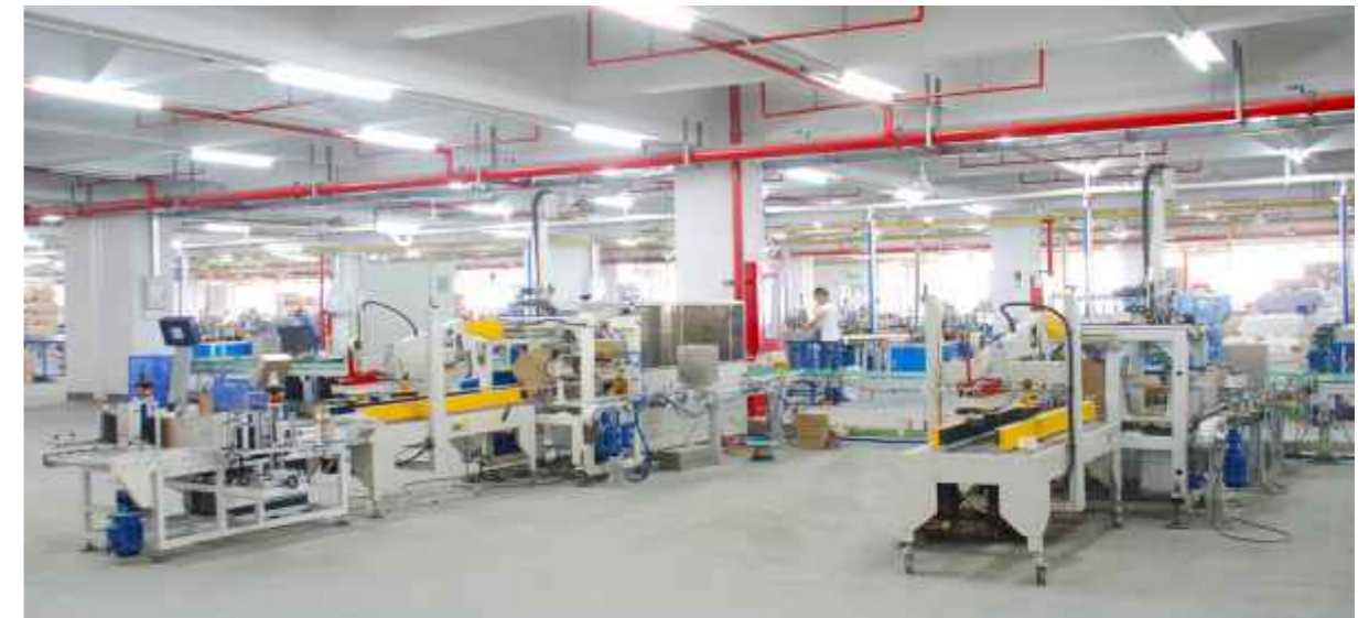
▲ PVC Switch Box Automatic Detecting , Sorting, And Packaging Line