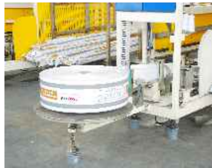
● Bagging Structure