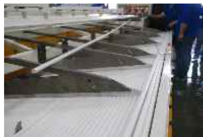
● Pipe Displacement